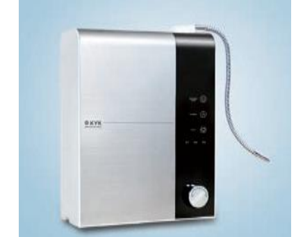
Higen3 [ Standard type ]