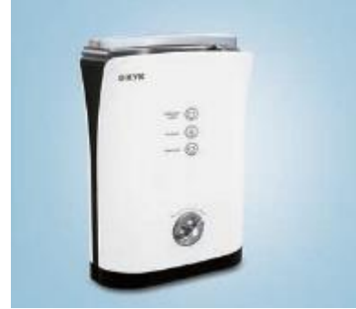
Higen1 [ Standard type ]